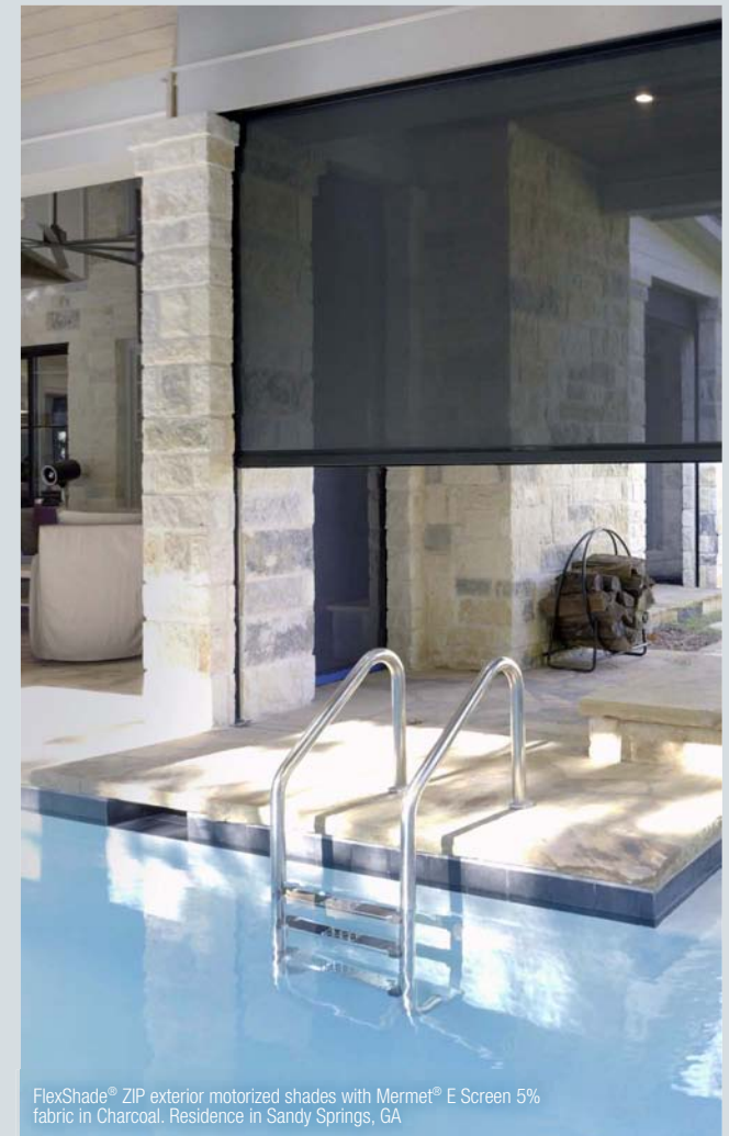
FlexShade® ZIP exterior motorized shades with Mermet® E Screen 5% fabric in Charcoal. Residence in Sandy Springs, GA