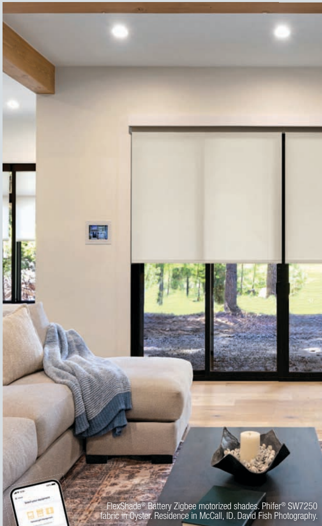
FlexShade® Battery Zigbee motorized shades, Phifer® SW7250 fabric in Oyster. Residence in McCall, ID.