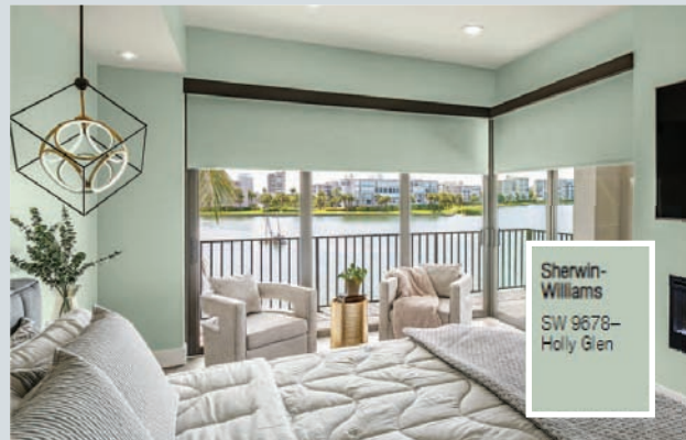
Sherwin-Williams SW 9678— Holly Glen

Draper® offers an unmatched spectrum of beautiful and functional fabric colors and styles from U.S. weavers Phifer® and Mermet USA® to solve any performance or aesthetic challenge.